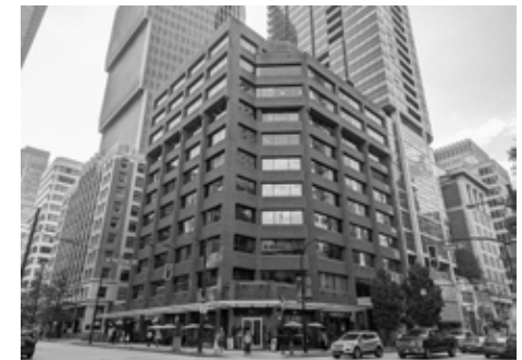
200-808 W Hastings Street, Vancouver