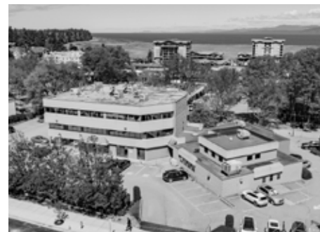
100B-154 Memorial Avenue, Parksville