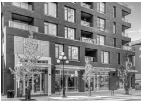
843 Johnson Street, Victoria