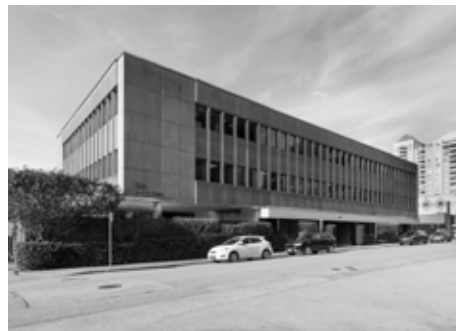
350-522 7th Street, New Westminster