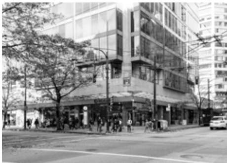
430-605 Robson Street, Vancouver

More dedicated commercial offices in British Columbia than anyone else.