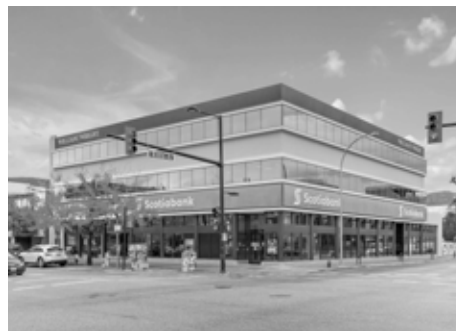
205-478 Bernard Avenue, Kelowna