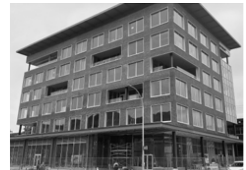
406-121 5th Avenue, Kamloops

From Chilliwack to Whistler, Merritt to Kelowna, Victoria to Nanaimo, and everywhere in between.