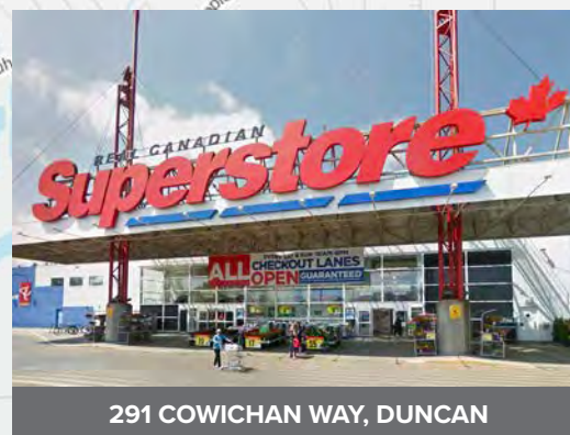
291 COWICHAN WAY, DUNCAN