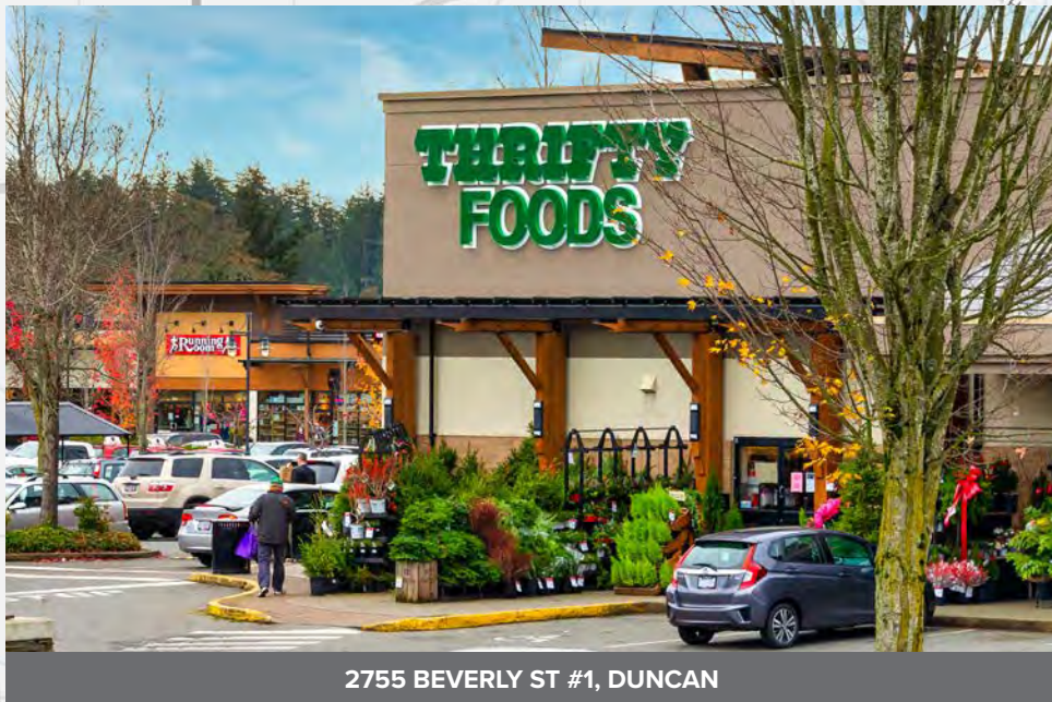
2755 BEVERLY ST #1, DUNCAN