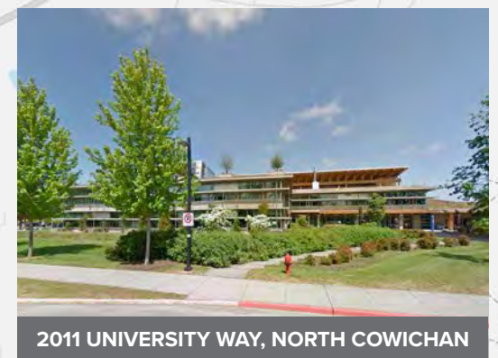
2011 UNIVERSITY WAY, NORTH COWICHAN