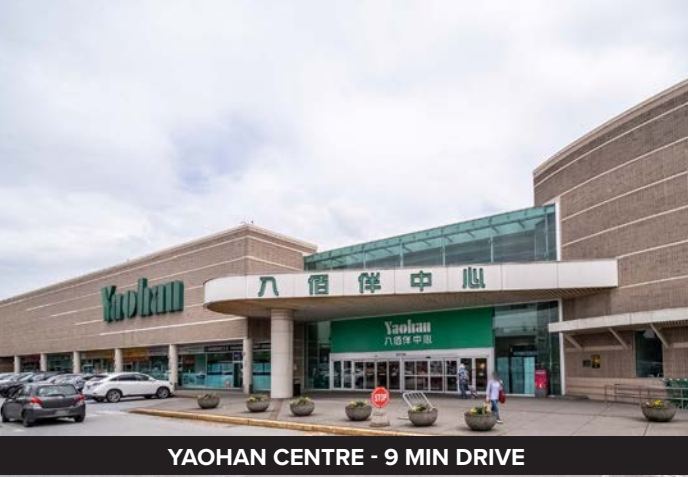
YAOHAN CENTRE - 9 MIN DRIVE