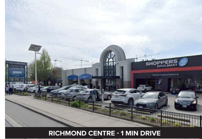
RICHMOND CENTRE - 1 MIN DRIVE