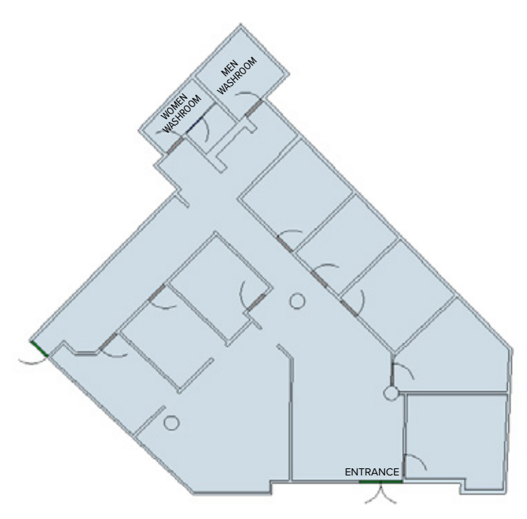
Disclaimer: Measurements are approximate and shall be verified by the Tenant if deemed important.