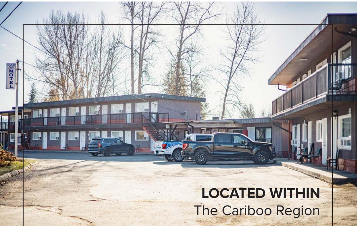
LOCATED WITHIN The Cariboo Region