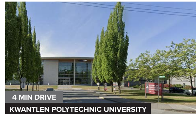
4 MIN DRIVE KWANTLEN POLYTECHNIC UNIVERSITY