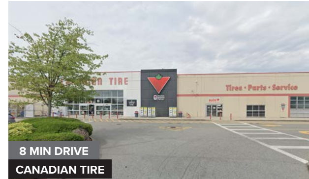
8 MIN DRIVE CANADIAN TIRE

A culturally diverse community, Newton is home to the region's largest South Asian community and the heart of South Asian eats, clothing, and jewellery shops. Every year Newton hosts one of the largest Vaisakhi Parades outside of India, welcoming more than 400,000 people. Newton also includes the historic village of Sullivan, anchored by the Sullivan Community Hall, as well as the Panorama neighbourhood.