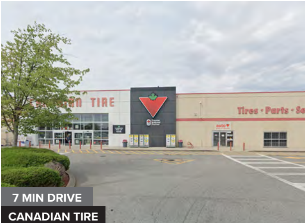
7 MIN DRIVE CANADIAN TIRE