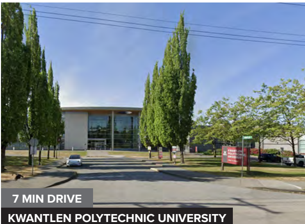
7 MIN DRIVE KWANTLEN POLYTECHNIC UNIVERSITY