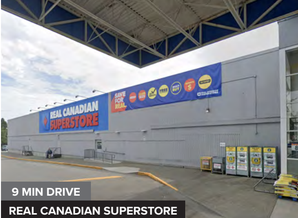
9 MIN DRIVE REAL CANADIAN SUPERSTORE