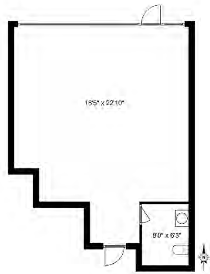
Measurements are approximate and shall be verified by the Tenant if deemed important.