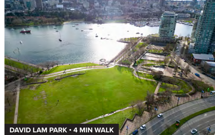
DAVID LAM PARK • 4 MIN WALK